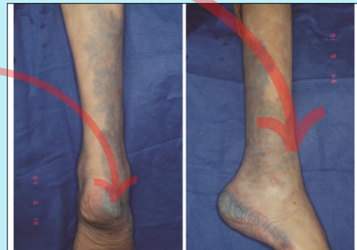
Fig. 15. The peroneal artery's angiosome extends from the midline of the posterior calf (left) to the anterior edge of the lateral compartment (right). It extends inferiorly to the anterolateral ankle and lateral heel. Reprinted with permission from Attinger, C. Vascular anatomy of the foot and ankle. Oper. Tech. Plast. Reconstr. Surg. 4: 183, 1997.